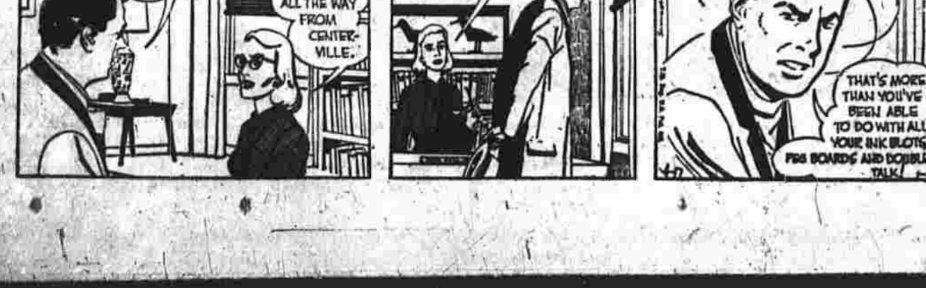
THE STORY OF MARTHA WAYNE