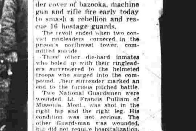
2 Leaders Of Convicts Kill Selves