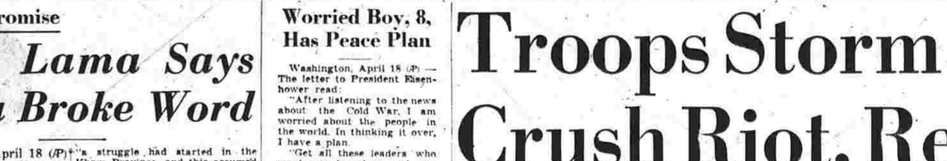
Worried Boy, 8, Has Peace Plan

Cloudy, milder, occasional showers developing tonight. Sunday cloudy, showers, little change in temperature.