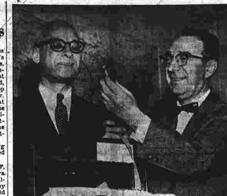
Donates Gift to MMH